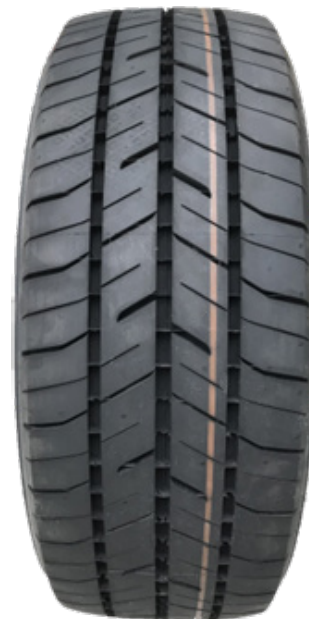
Pic. 1: Jenoptik summer profile