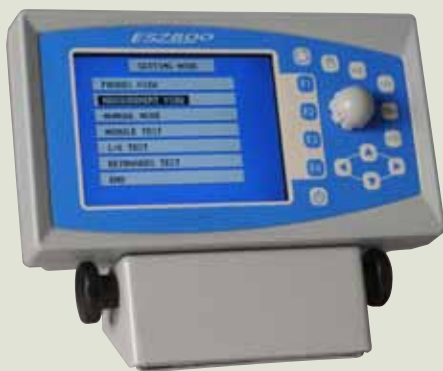
Main module: horizontal version with swiveling top table support