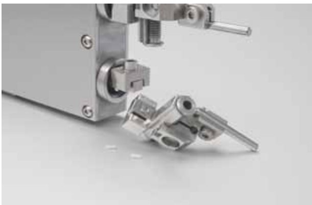
Movoline DMprotect 200

The optional crash protection system (predetermined breaking point for gage arm) protects the gage head, gage arms and the workpiece from damaging in case of collision, hence preventing downtimes.