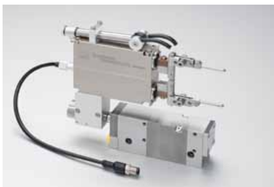
Movoline DM400 gage head with spacer block